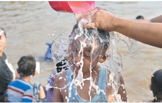
▲印尼部分穆斯林在進入齋戒月前，前往西薩達河沖洗身體，象徵洗滌心靈。

Indonesia's Muslims are celebrating the holy month of Ramadan despite soaring food prices due to supply disruptions caused by Russia's invasion of Ukraine. Indonesia has the world's largest Muslim population. Nearly 90% of the country's 277 million people are Muslim. Ramadan is a time of fasting, prayer, and religious contemplation. Muslims refrain from food, drink, smoking, and sex from sunrise to